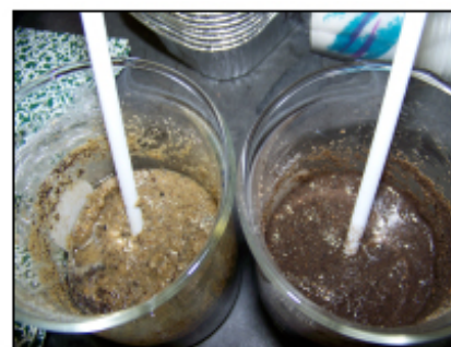
Preparing saturated pastes.

The saturated paste method provides a more representative measurement of total soluble salts in the soil solution because it is closer to the water content of the soil under field conditions. This method, however, is time-consuming and subject to some technician variability when preparing the paste. This test package also includes extraction of soils with ammonium acetate ( \text{NH}_4\text{OAc} ) to measure exchangeable cations and ESP.